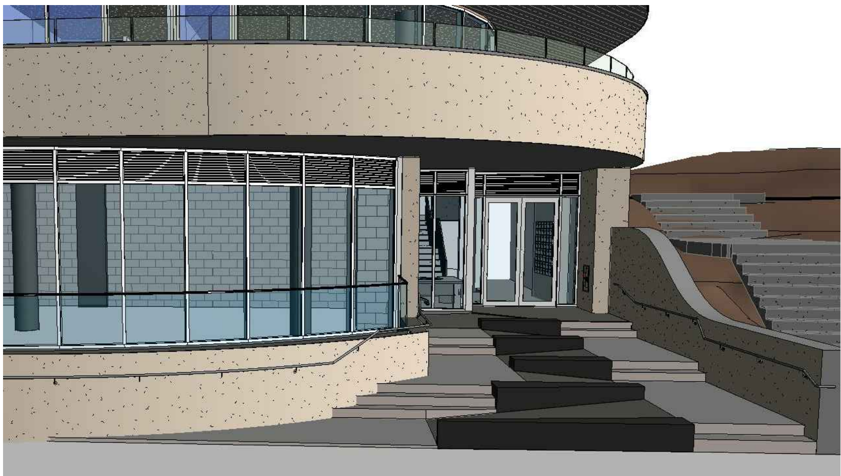
3 3D View 1 : 25